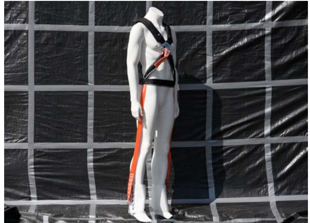
2. Here the trouser unit has been removed to expose the leg lanyard and calf gaiter. In the event of a fall the front point attachment pulls and clenches the calf gaiter.