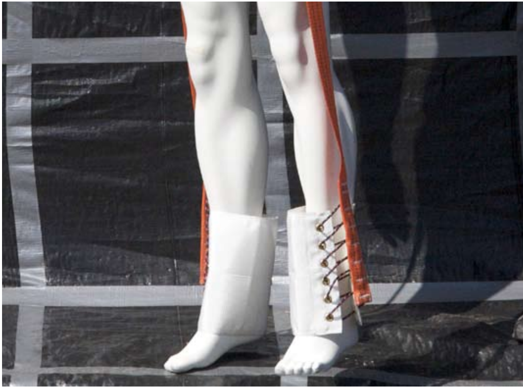
3. The exposed calf gaiter shown here.