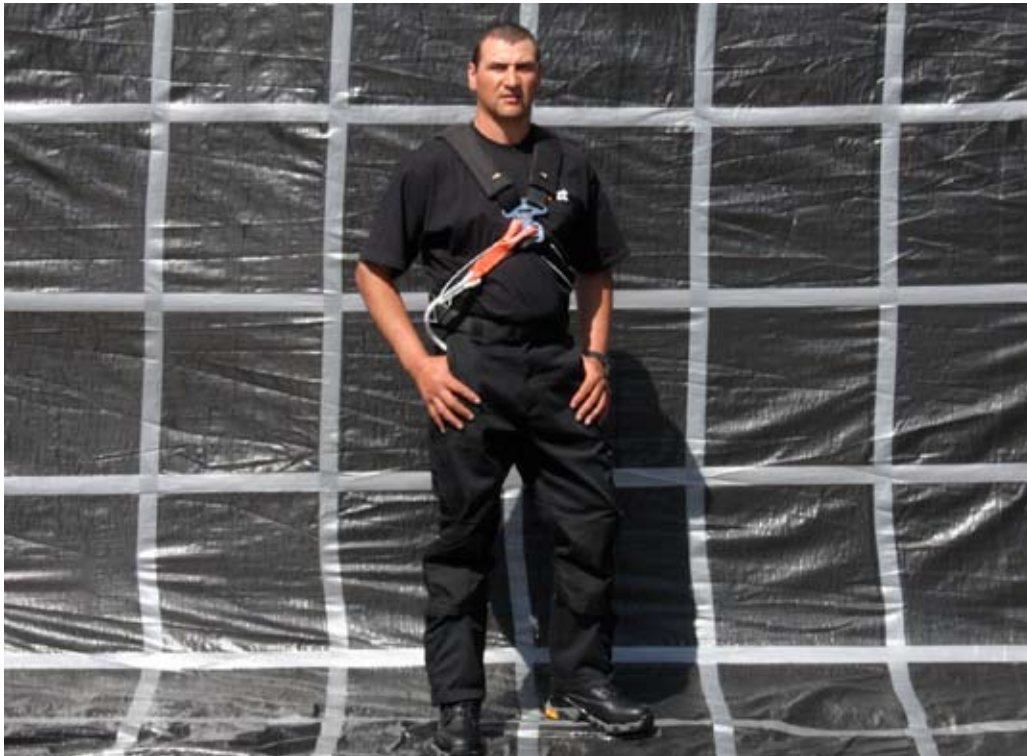
1. The ZT Safety Harness is shown as fitted and worn for work, with front point attachment and carabiner shown here in stowed position.