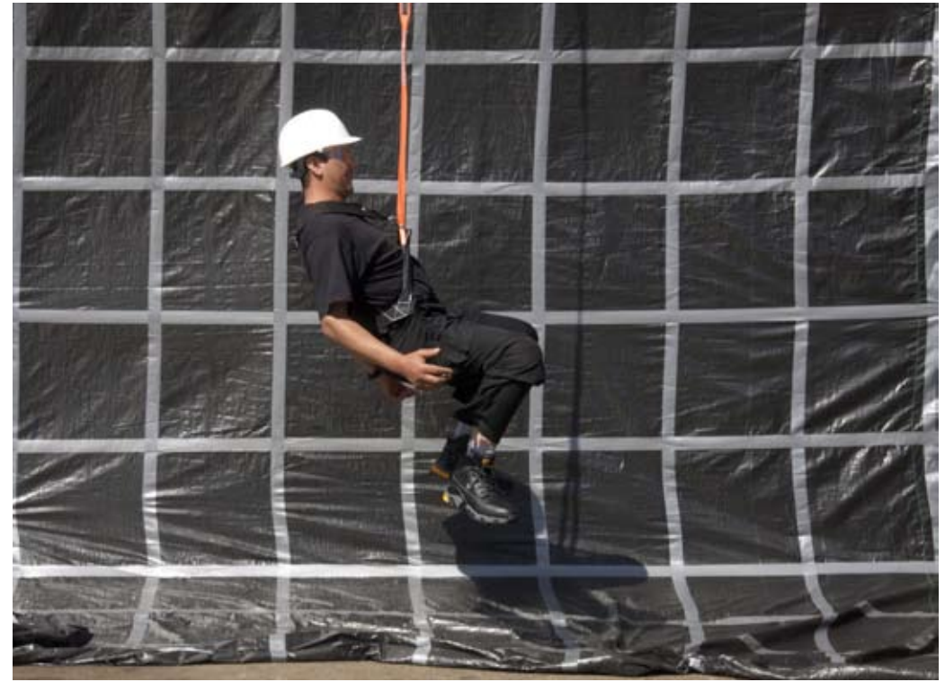
2. In the event of a fall the calf gaiter clenches, pulling on the fronts of the legs, the fall forces are distributed evenly on the body pulling it into a seated position. The bodies resistance to this action help to absorb some of the fall forces, further reducing risk of trauma.